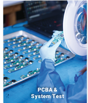
PCBA & System Test