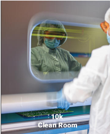
10k Clean Room