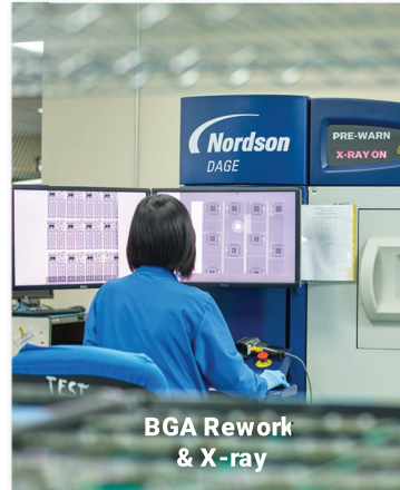
BGA Rework & X-ray