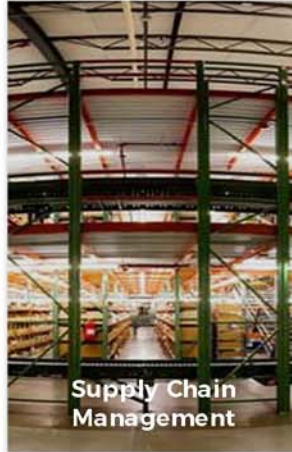
Supply Chain Management