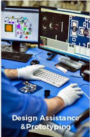
Design Assistance & Prototyping