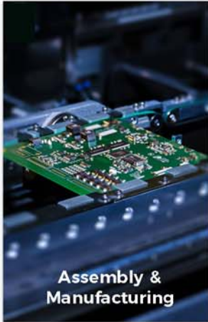
Assembly & Manufacturing